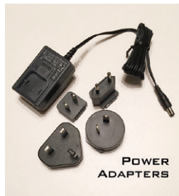
Figure 4 – Power Adapter