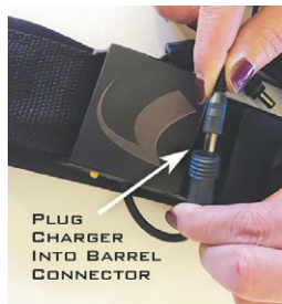
Figure 3 – Battery Charging