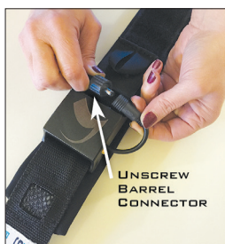
Figure 2 – Barrel Connector

Please note all batteries have a finite life time. Charging times and usage time will vary as the battery ages and is charged and discharged.