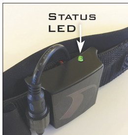
Figure 1 - Status LED

CAUTION: If the LED turns on or blinks abnormally or unexpectedly, do not attempt to charge or use your NoShark device. Call or email NoShark product support.