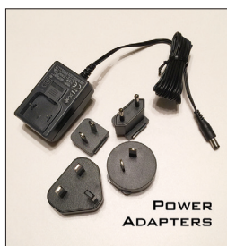
Figure 4 – Power Adapter